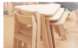
O-musubi Miyuki Uchida