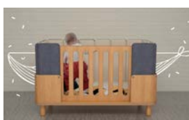
Franca / crib&bed Natalia Campos