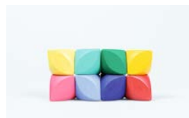
Vulpi - Magnetic Toys Tobias Thomas